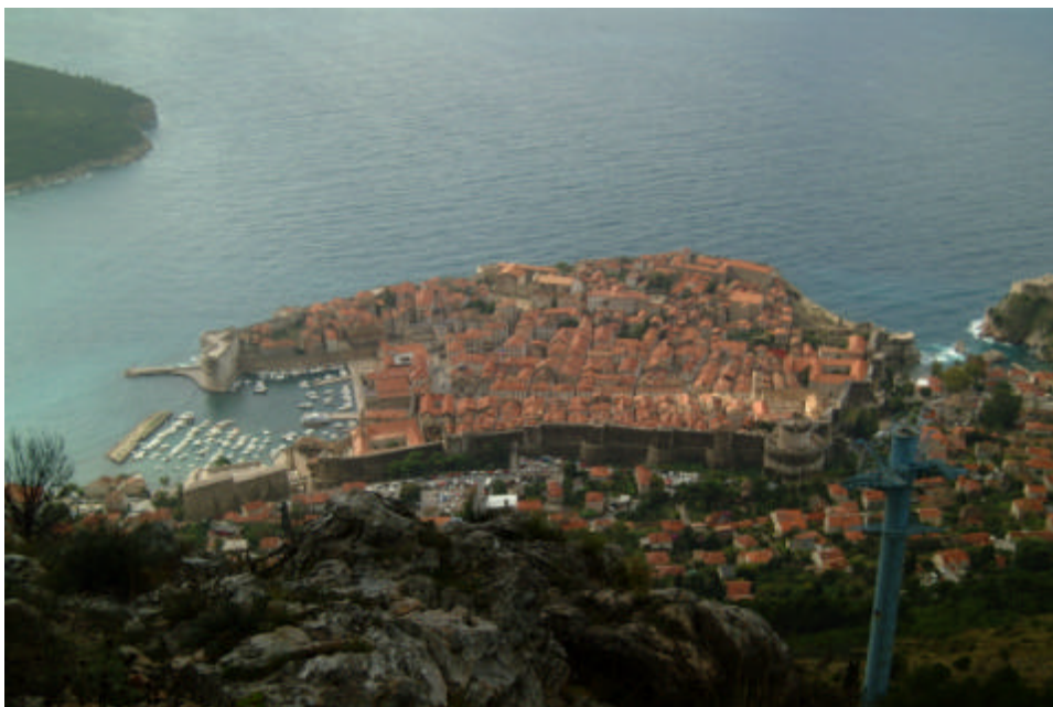
Dubrovnik view from mountain Srdj