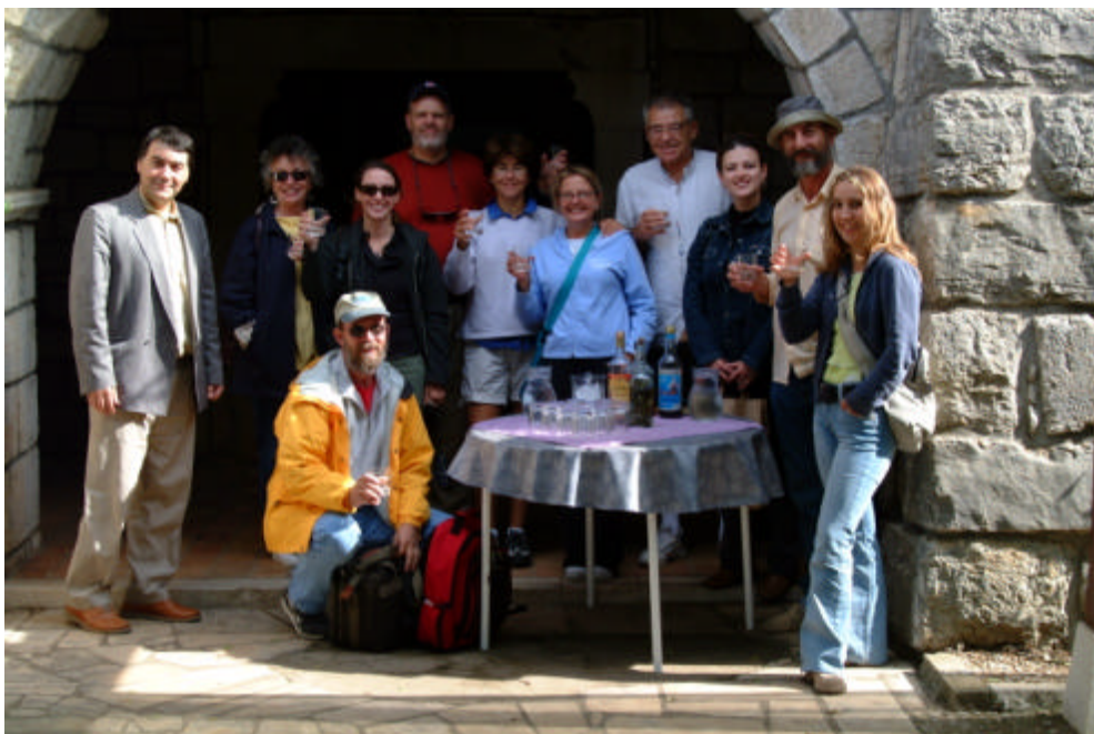
Dubrovnik workshop participants on the Mljet island.